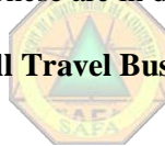
Exhibit 2: External Issues for Small Travel Business

The following step is the external environment analysis or External Scenario Agenda for small travel businesses. These are in detailed in Exhibit 2.